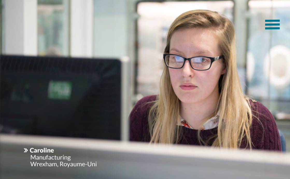
» Caroline Manufacturing Wrexham, Royaume-Uni