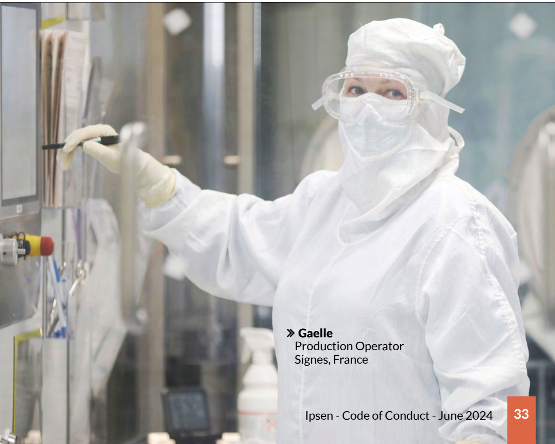
» Gaelle Production Operator Signes, France

No. I can only provide HCPs with materials and content that have been duly approved by Ipsen for that intended use, according to the applicable Promotional Materials SOPs and in accordance with the country regulations on when promotion of new products or indications can begin.