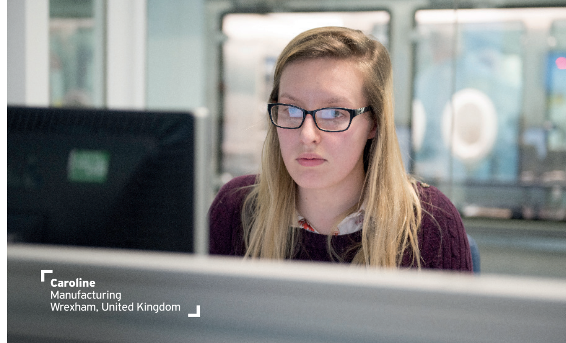
Caroline Manufacturing Wrexham, United Kingdom