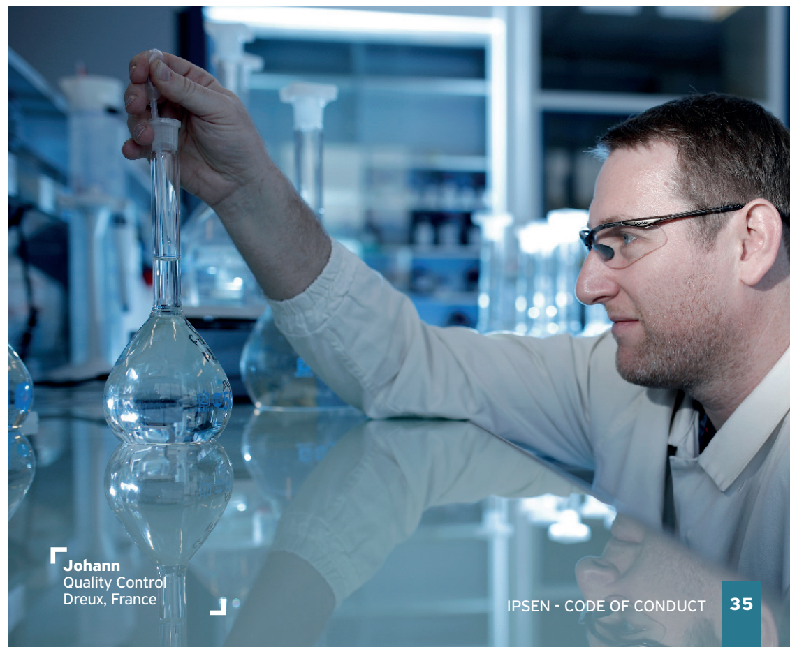
Johann Quality Control Dreux, France

No. I can only provide HCPs with materials and content that have been duly approved by Ipsen for that intended use, according to the applicable Promotional Materials SOPs and in accordance with the country regulations on when promotion of new products or indications can begin.